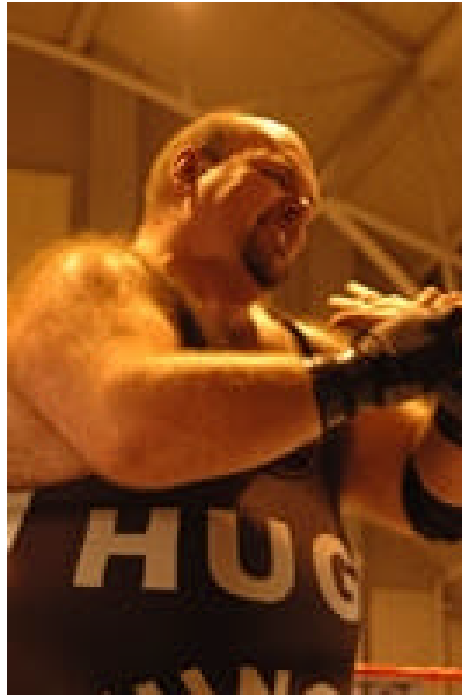
Take my hand